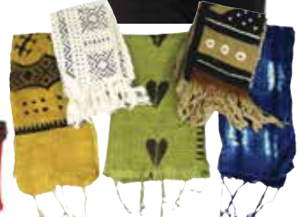
Mud Cloth Scarf/Sash Assorted Colors. Made in Mali. C-A200