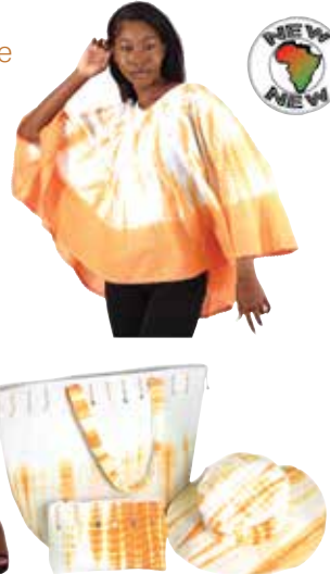
Tie Dye Dashiki, Hat, & Handbag Set C-WK496