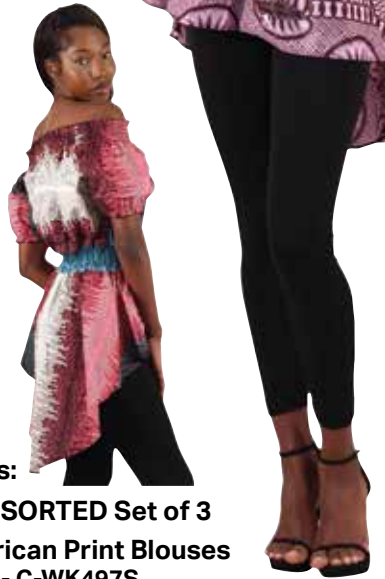
ASSORTED Set of 3 African Print Blouses LG - C-WK497S 2X - C-WK498S