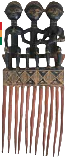
Ghanian Ashante Village Hairdressers Trophy A-WC796