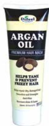
Argan Oil Premium Hair Strengthening Mask - 8 oz.

Will fit up to a 52" chest and is 31" in length, with 16" sleeves. Matching kufi cap. Made in India of 100% cotton. C-U296