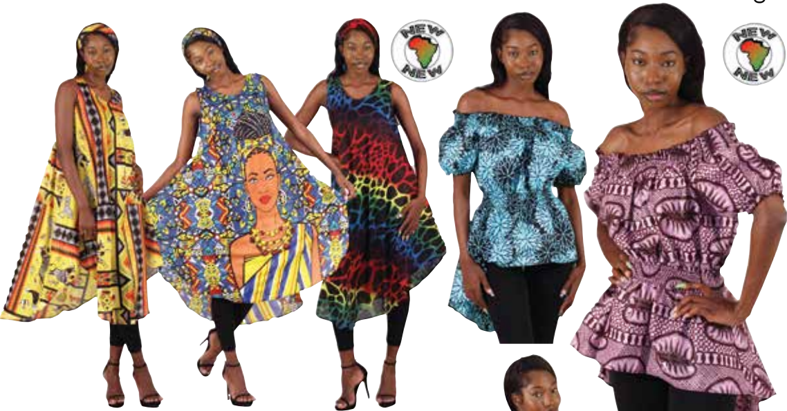
Set of 3 Tribal Print Umbrella Dresses C-WK500S