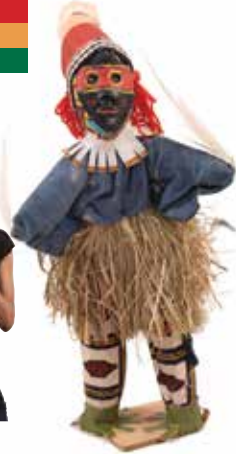
Dan Dancer Figures from Ivory Coast 14-18" A-WC793