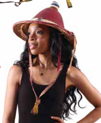
Dogon Straw Hat