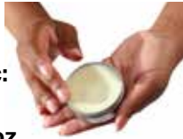
Afrikan Republic: Shea Butter - Brown Sugar: 1 oz. M-R165