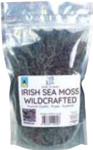
Purple Irish Sea Moss - 4 oz. M-R020