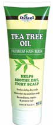
Tea Tree Oil Premium Scalp Soothing Hair Mask - 8 oz.